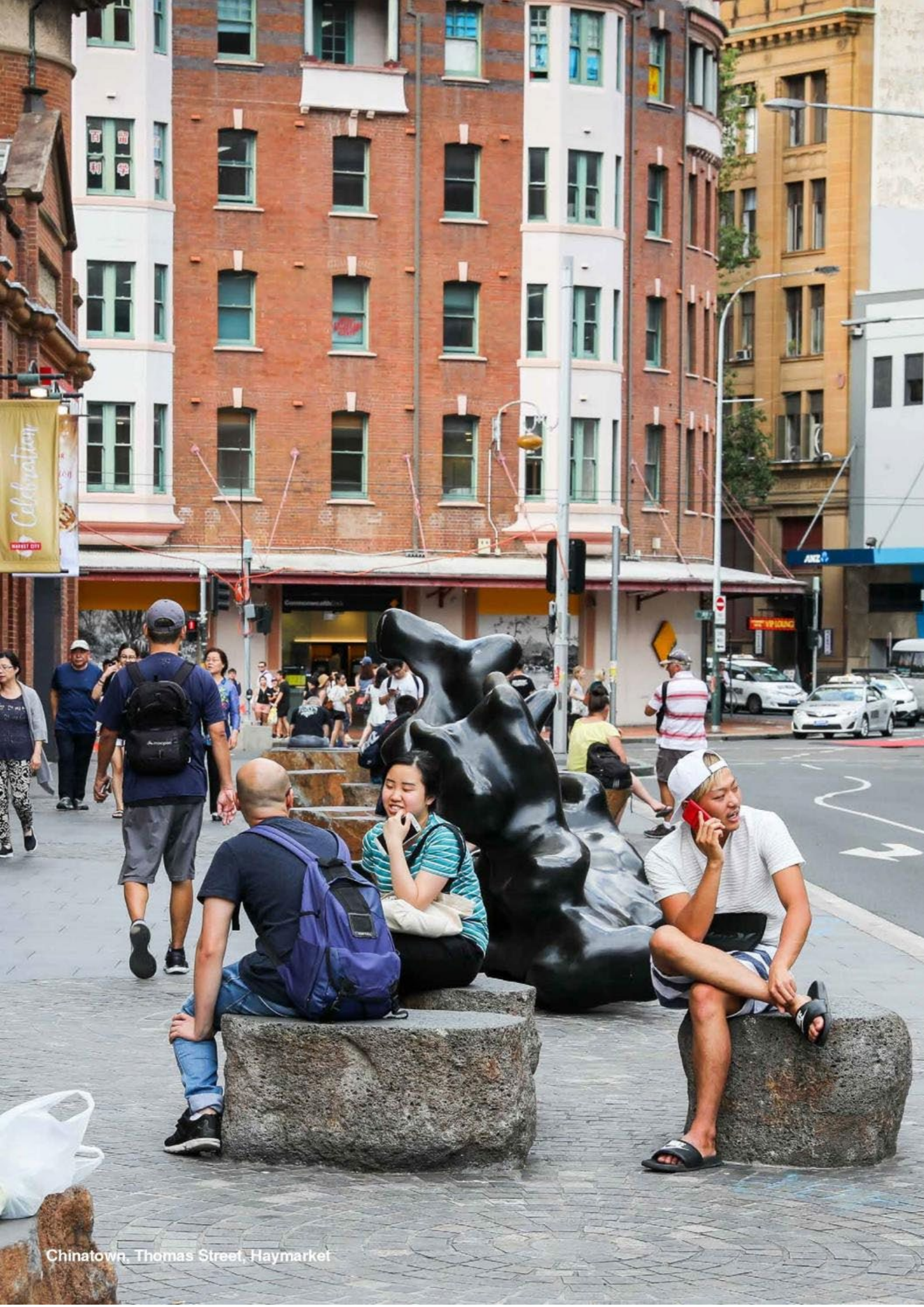
Chinatown, Thomas Street, Haymarket