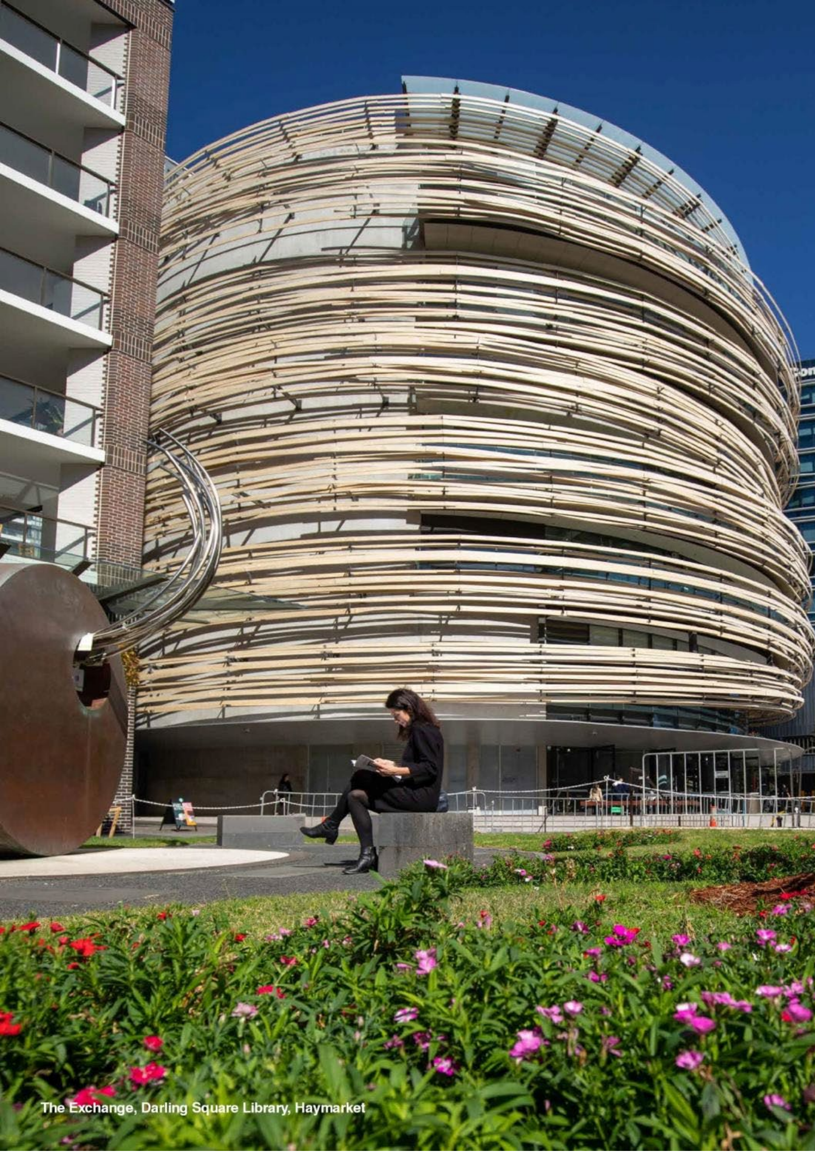
The Exchange, Darling Square Library, Haymarket