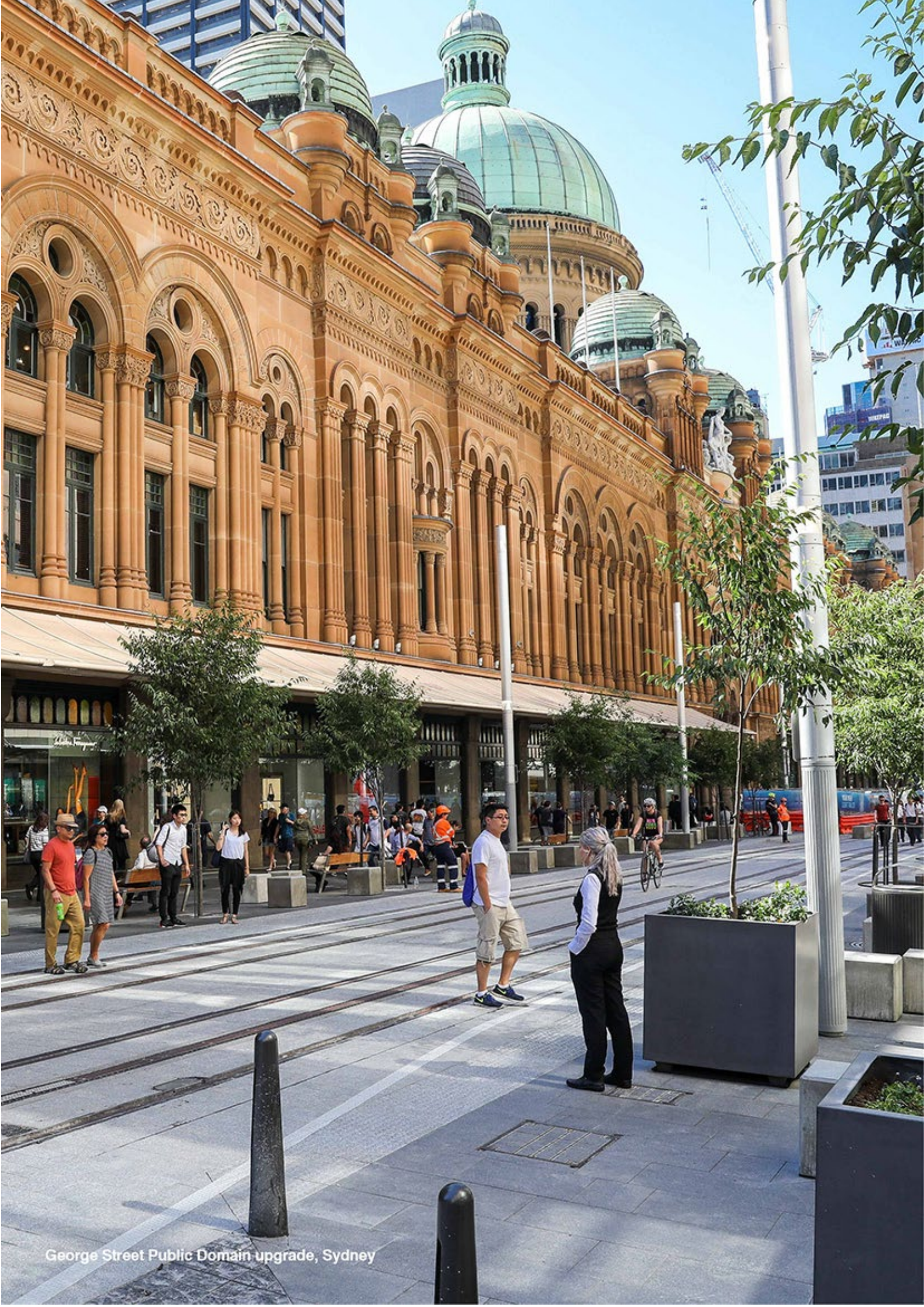
George Street Public Domain upgrade, Sydney