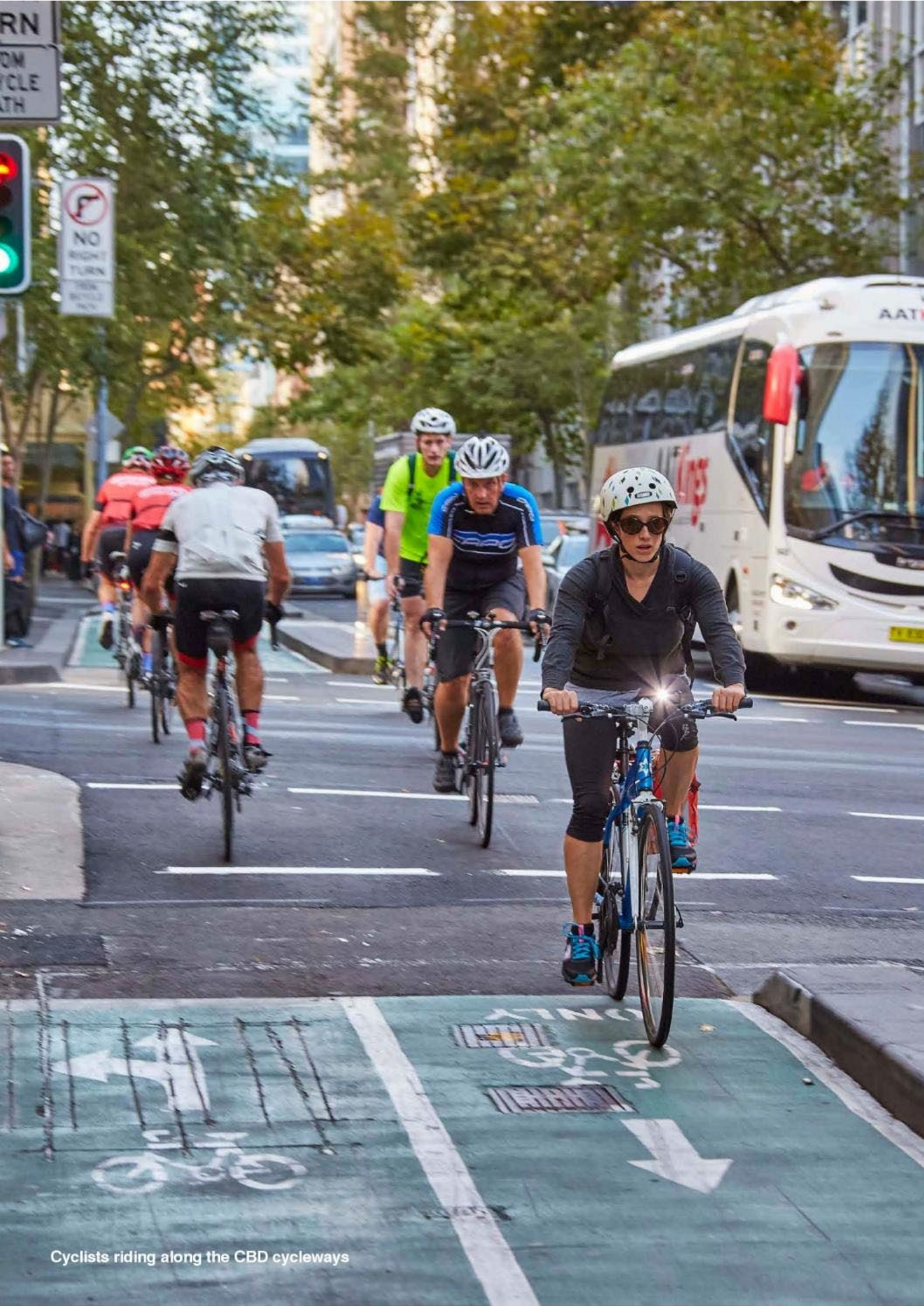
Cyclists riding along the CBD cycleways