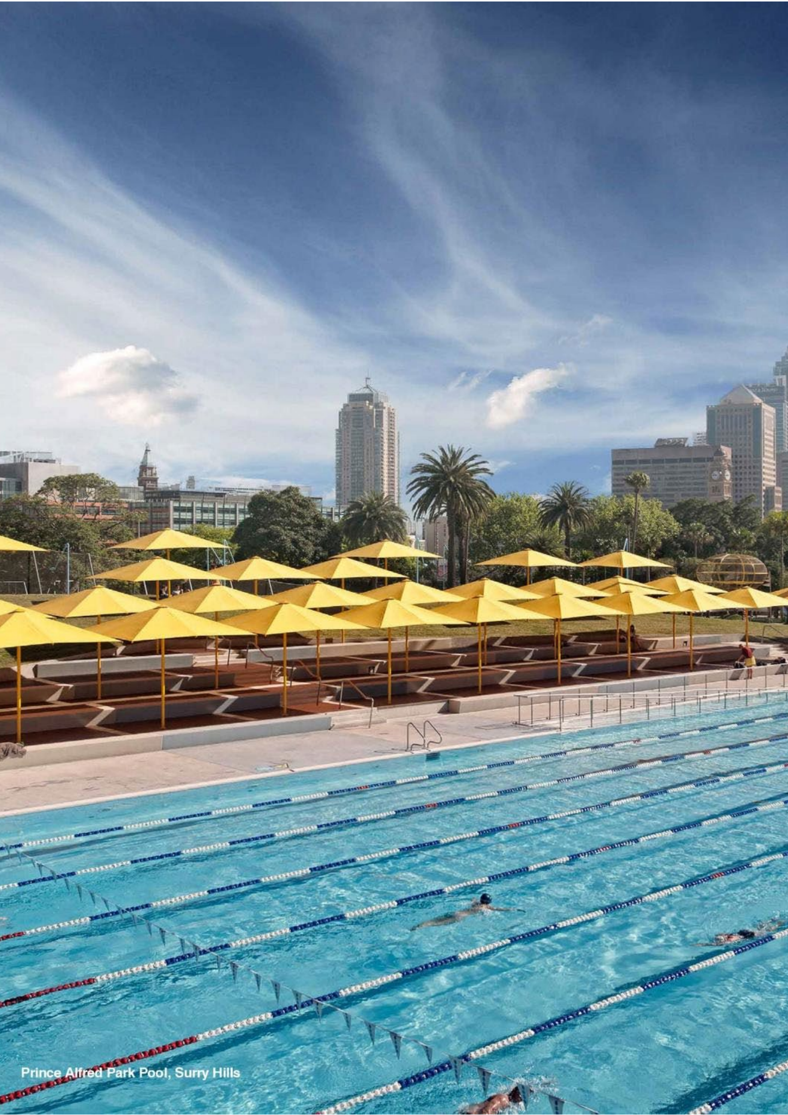
Prince Alfred Park Pool, Surry Hills